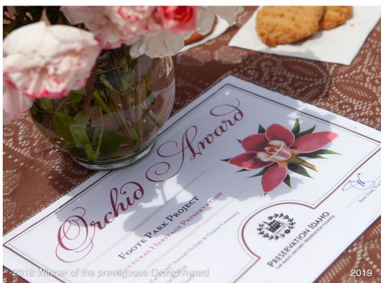
2018 Winner of the prestigious Orchid Award 2019