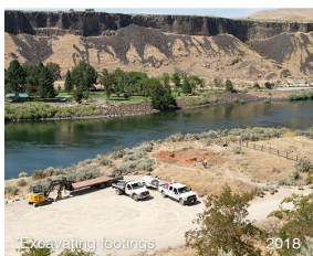
Excavating footings 2018