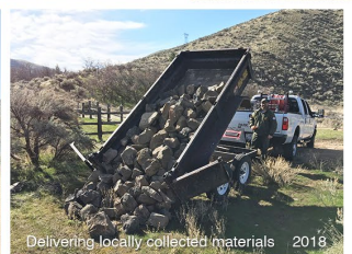
Delivering locally collected materials 2018