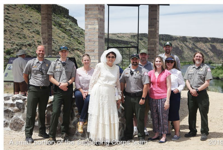
A small portion of the supporting Corps team 2019