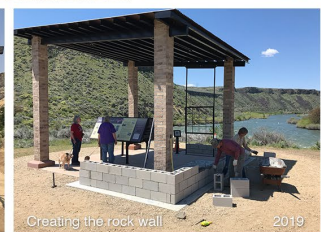
Creating the rock wall 2019