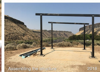
Assembling the structure 2018