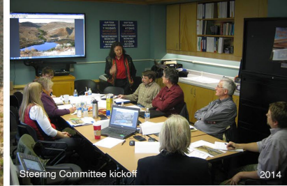
Steering Committee kickoff 2014