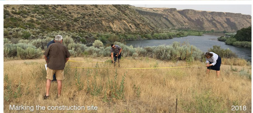
Marking the construction site 2018