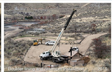
Boulder-lining and restroom installation 2015