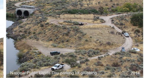
National Public Lands Day parking lot grubbing 2014