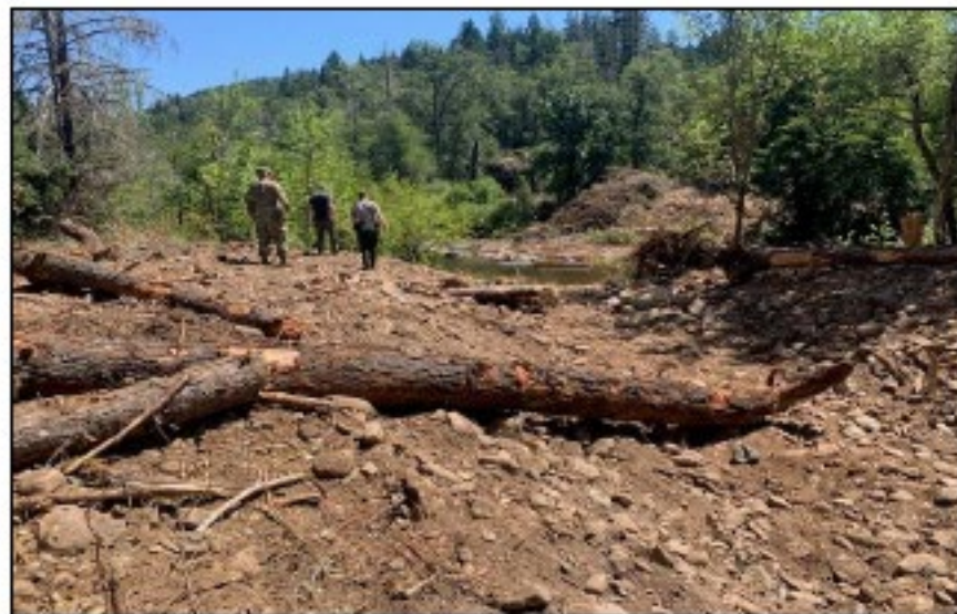
Side channel excavation with large woody debris. Logs donated by BLM and Hancock Timber- salvage from 2018 Miles wildfire that burnt 200+ ac in Elk Creek.