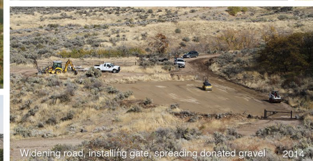
Widening road, installing gate, spreading donated gravel 2014