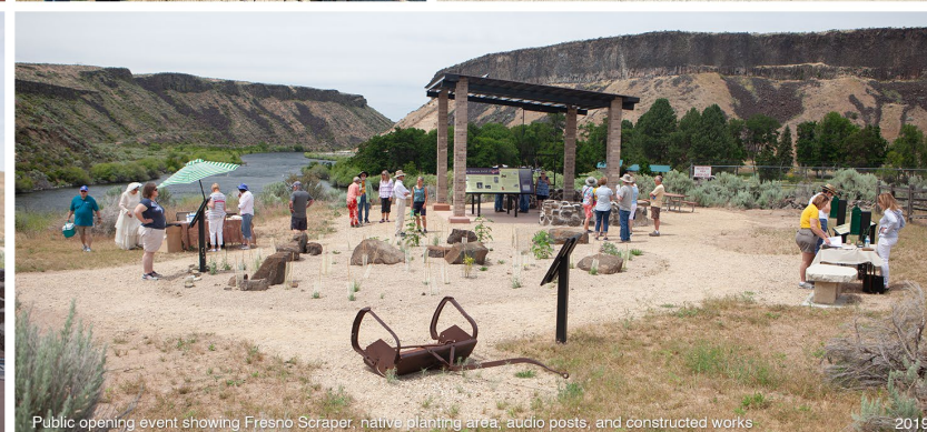
Public opening event showing Fresno Scraper, native planting area, audio posts, and constructed works 2019