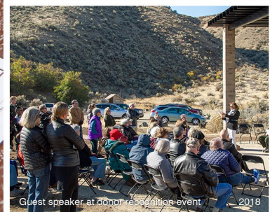
Guest speaker at donor recognition event 2018